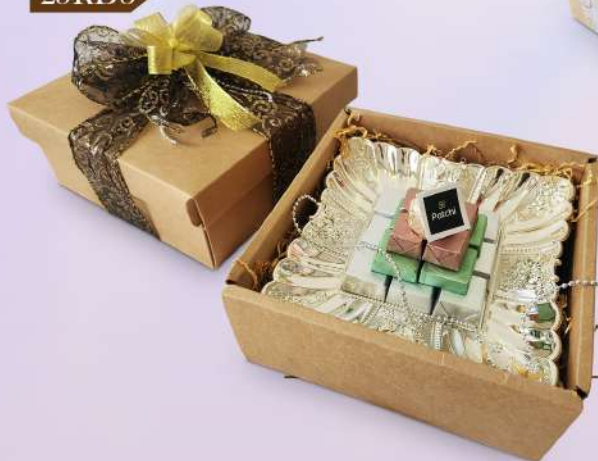
Patchi Sheklat RM588