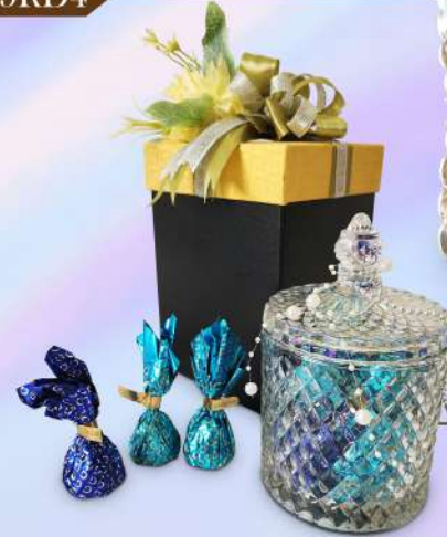
Patchi Sheklati RM668

Patchi Chocolates 360g in Galipoli Glass (10.5cm x 18cm H).