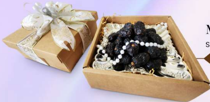
Mivel Kurma RM165 Safawi Kurma Jumbo 360g