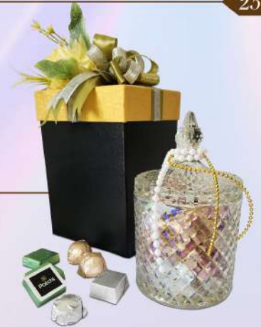
Godiva Shadi RM245

Whittard Luxury Hot Chocolate 350g, Godiva Crispy Hazelnut Chocolate 4pcs, Honestly Peanut Butter 350g, Dragee - Chocolate, Almond & Fruits 180g, Apricot 140g, Boh Seri Songket Lemon Mandarin 10s, Almond Biscotti 168g, Pineapple Fruit Slice 148g, Kiwi Fruits 148g & Sultana Fruit Cake 80g.