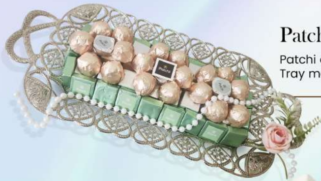
Patchi Velvety RM1238

Patchi chocolates 738g on Silver plated Tray measuring 22cm x 43cm.