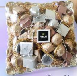
Godiva Shadi RM245

Godiva Crispy Hazelnut Choc 123g in Galipoli Glass (10.5cm x 18cm H).